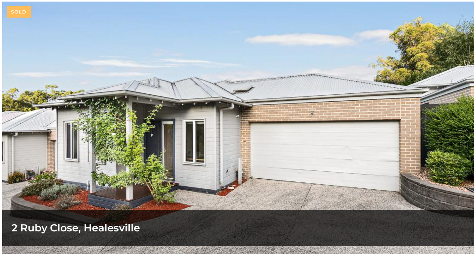
2 Ruby Close, Healesville