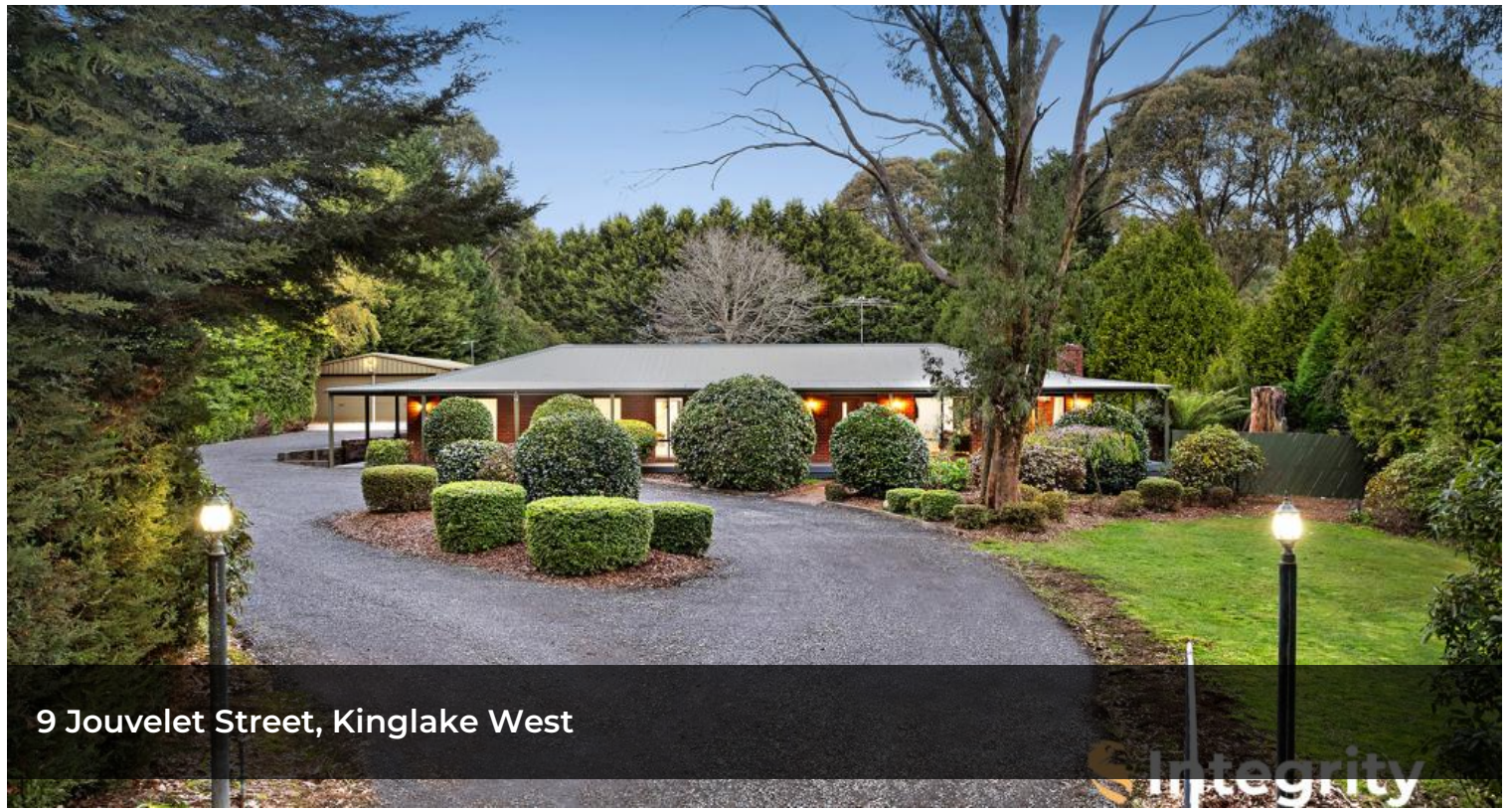
9 Jouvelet Street, Kinglake West