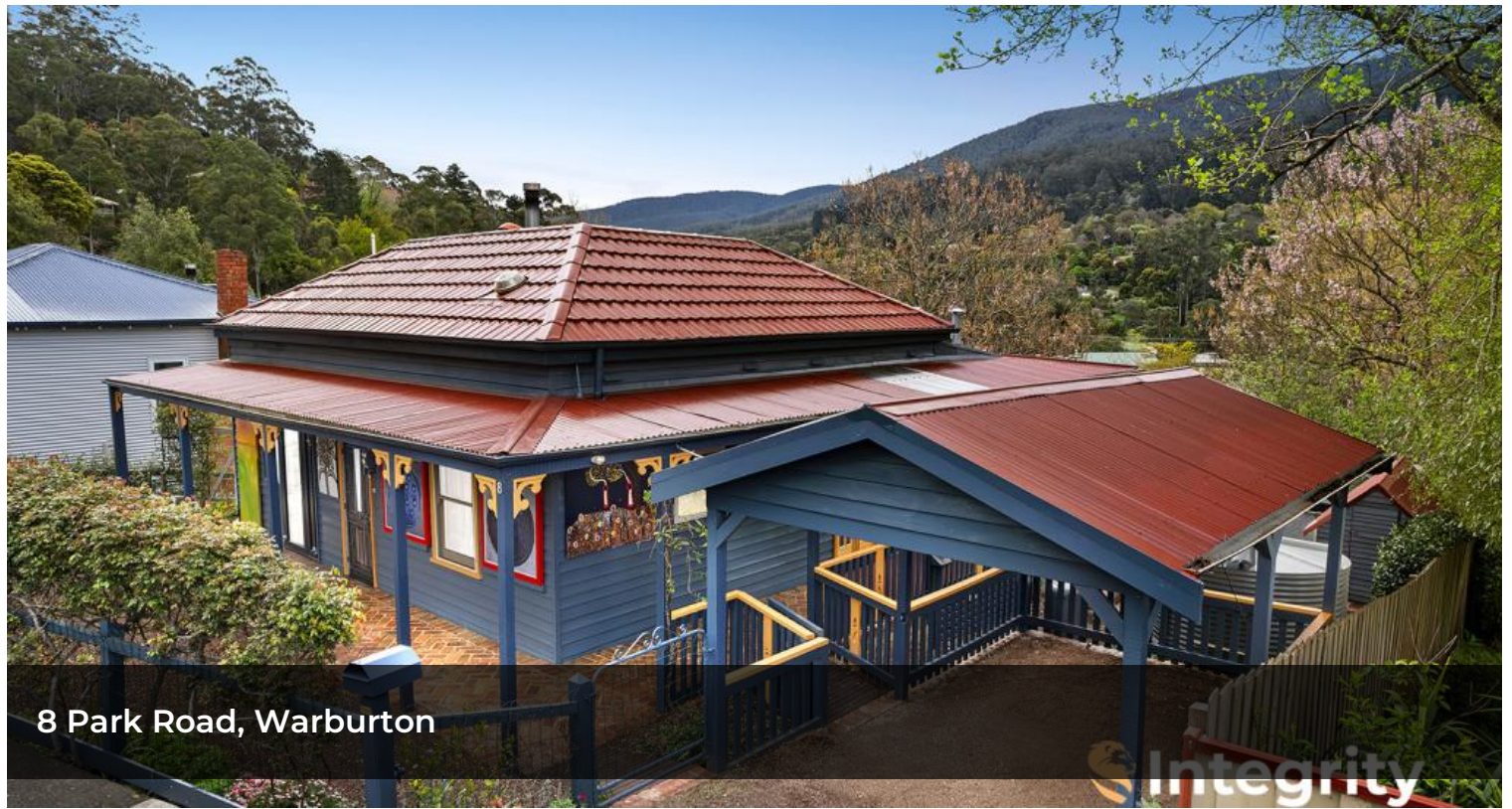
8 Park Road, Warburton