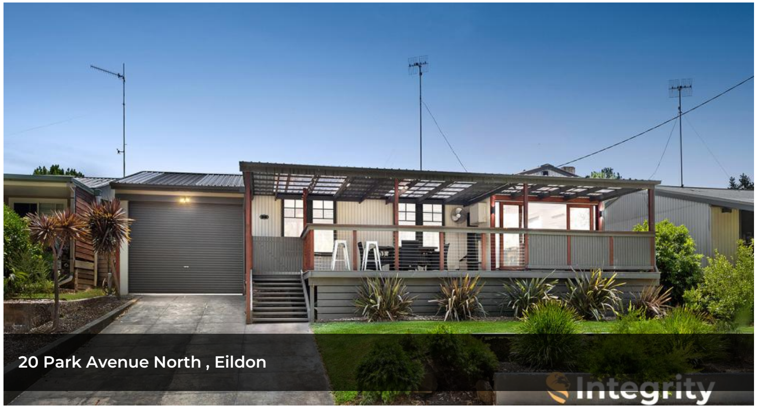
20 Park Avenue North , Eildon